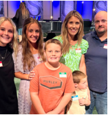
Statement of Faith- Gibson family

9:30am Sunday School 10:45am Kid’s-4-Christ-Childrens Bldg 10:45am Morning Worship- Falls Creek Report