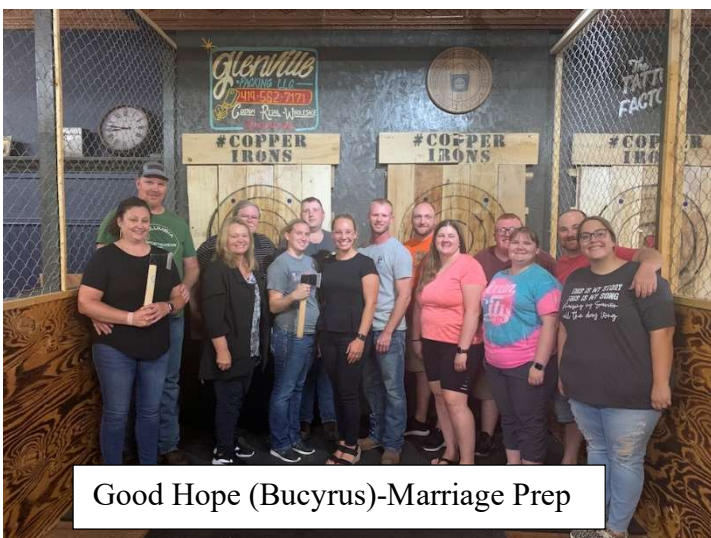
Good Hope (Bucyrus)-Marriage Prep