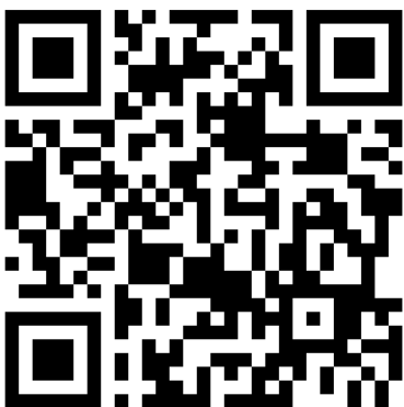
Wishing HC Family a happy holiday