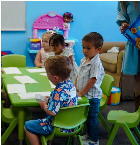
Moments in Nursery/Preschool

The following are examples of the type of photography we are looking for on a regular basis.