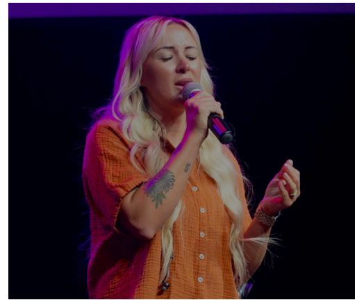
Worship leaders in action