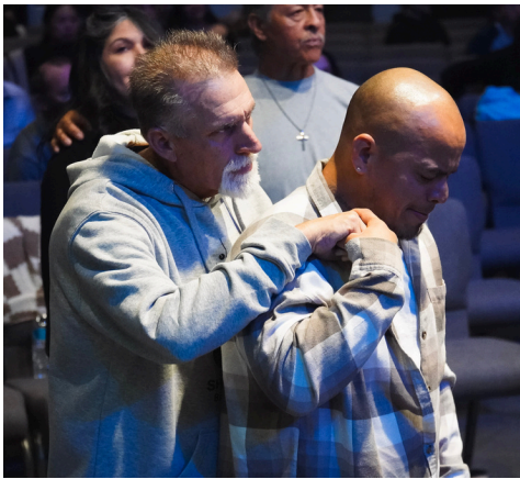
Moments of prayer at the altar

The following are examples of the type of photography we are looking for on a regular basis.