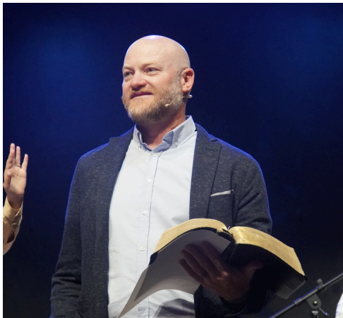
Pastors or Speakers on stage