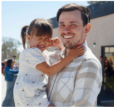
Posed pictures of families/friends or individuals