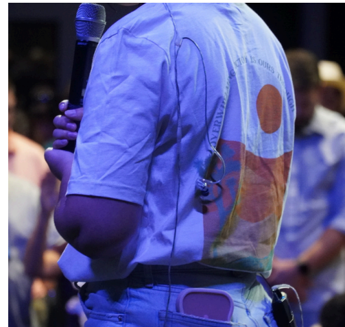
Detail shots of merch