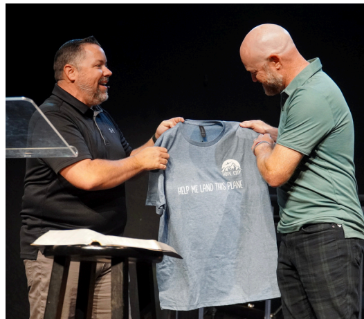
Special on-stage moments