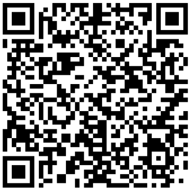
Text Over B-Roll