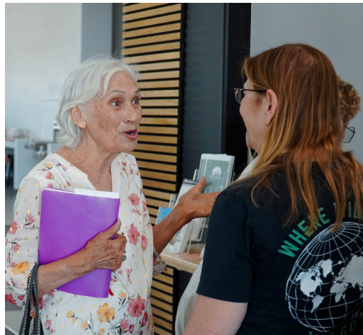
Candid moments with congregants