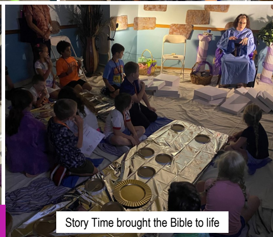
Story Time brought the Bible to life