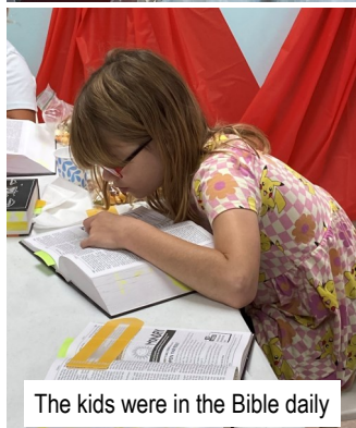
The kids were in the Bible daily