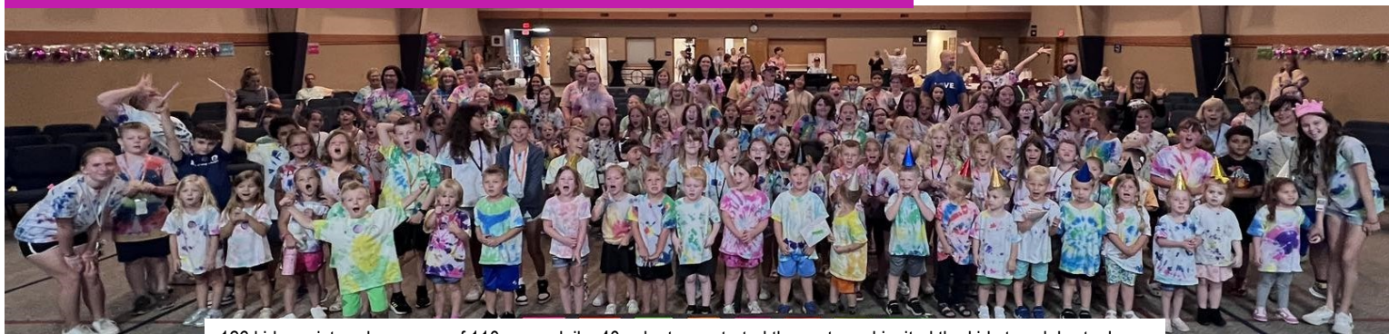
126 kids registered, average of 110 came daily; 40 volunteers started the party and invited the kids to celebrate Jesus