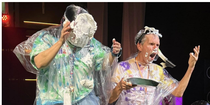
The boys vs. girls fundraising competition raised $2,097.33 for Safe Families

This summer has been amazing, and we're looking forward to building on this momentum for future events.