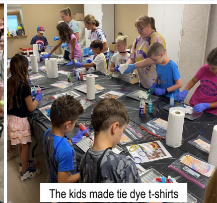
The kids made tie dye t-shirts