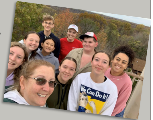
High School Fall Retreat

More retreat photos can be found at facebook.com/troymethodiststudents