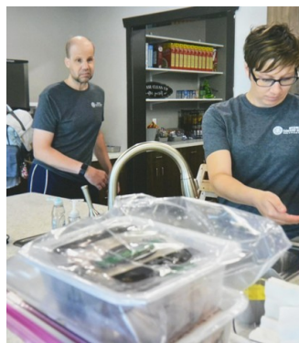
Our first group prepared lunch to be delivered to the hospitals on July 19, the second served dinner in Ronald McDonald House on July 25.