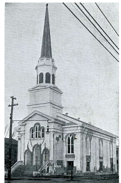
Original building on Church and Laurel

After failed efforts to acquire adjacent property to allow expansion, the church’s Board of Stewards elected to begin looking elsewhere for property to construct a new church building. As was commonplace for Methodists, several committees were tasked with finding a site, choosing an architect, and hiring a contractor. An ideal property with plenty of room for future expansion was selected at the corner of North and East Boulevards. The property was purchased, and construction on the current sanctuary began in 1924.