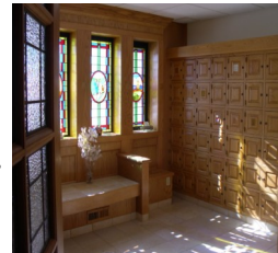
SUNLIGHT STREAMING THROUGH THE BEAUTIFUL STAINED GLASS WINDOWS

The Columbarium is elegant, yet simple, with beautiful oak paneling and columns overlooking the Tower Doors Garden. Sunshine streams through beautiful stained glass windows, created by members of First United Methodist Church, depicting the various stages of life from birth through death. The stone floor was imported from King Solomon’s Quarry in the Holy City of Jerusalem along with the meditation bench and window ledges. Two symbols embedded in the floor contain stones from the Black Sea, Dead Sea and the Sea of Galilee with the center black stone coming from a narrow path which led to the home of the High Priest, Caiaphas, where Jesus was led before being taken to Pontius Pilate. All these details come together to create a peaceful and serene resting place.