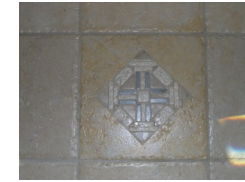
STONE FLOOR MADE FROM TILES AND STONES IMPORTED FROM KING SOLOMON’S QUARRY IN JERUSALEM