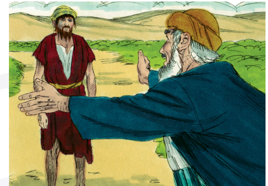
The idea of being “lost” is being outside the family of God.

The story of the Prodigal Son, or a lost boy, in the Bible ( Luke 15:11-32 ) is an analogy of the plight of man. In the story, the son rebels against his father’s way of life, takes his portion of his inheritance and goes and wastes it. He then finds himself alone and starving and without his family. He is lost. He then decides to go and apologize to the Father and ask if he could just be a servant in his father’s house. Once he repents, apologizes, and