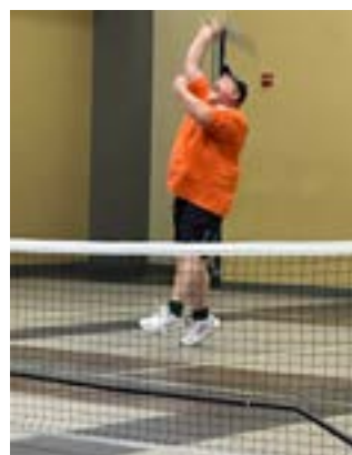
Pickleball in action