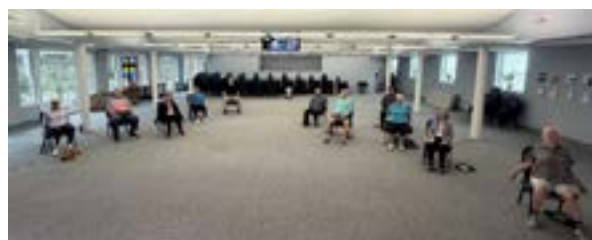
Members of the BFC Staying Strong class

This basic exercise class begins with a gradual warm-up, followed by upper and lower body and core and balance exercises, and finishes with a relaxing flexibility segment all while standing or seated. It's a great multilevel class appropriate for beginners, those looking to do prehab before surgery, or those looking to perform seated and standing exercise only.