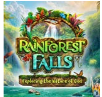
VBS: June 8-12

In other news, please note that our Sunday morning nursery has moved to the second floor of the Education Building, where other Sunday children's activities are already located. Those looking for a nursery for children birth to age two on Sunday mornings will now find it located in room 204.