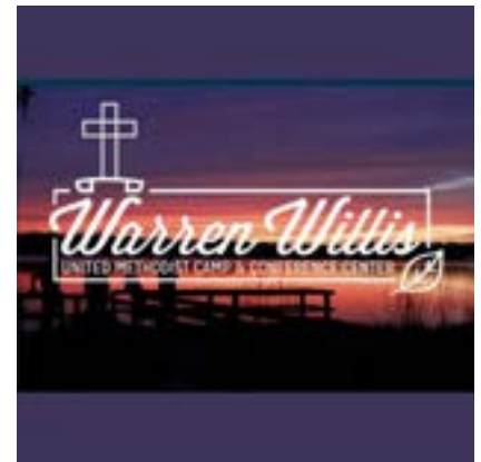
Camp: July 13-18