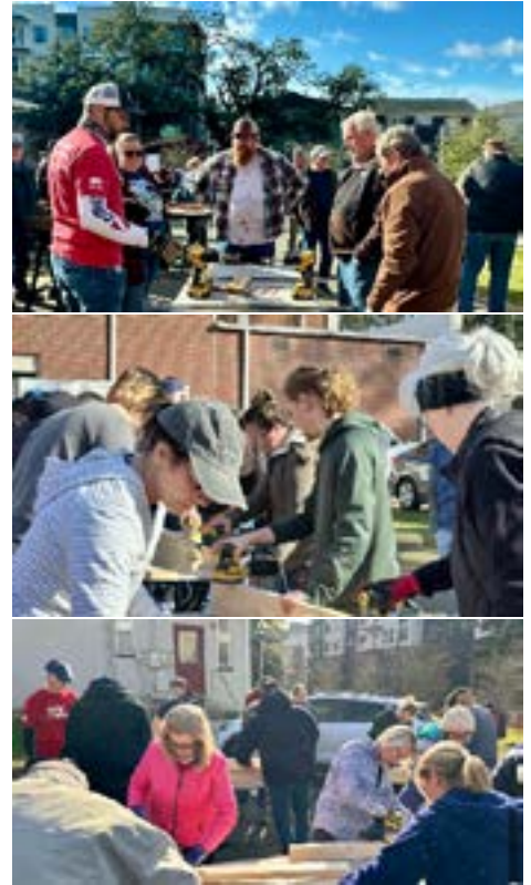
Images from our 2025 SHP Bed Build

We will be building twenty-five bunk beds (50 beds) on Saturday, February 21. As with our 2025 build, we will be teaming up with the FSU/TSC Wesley Foundation and will hold the event again at the Wesley Foundation Pensacola Street parking lot. We need at least seventy-five volunteers to assist with the actual build with tasks appropriate for all ages and abilities, from sorting nuts and screws, to sanding, to cutting lumber to size. Volunteers are also needed to serve on a welcoming committee, to provide coffee and light snacks for the work crew. Finally, we need delivery teams of two to three people per pickup truck to deliver and install the beds. These lucky volunteers have the pleasure of personally witnessing the joy of children receiving what are often the first beds of their own they've ever had. The more delivery teams we have, the more beds we can deliver that same day.