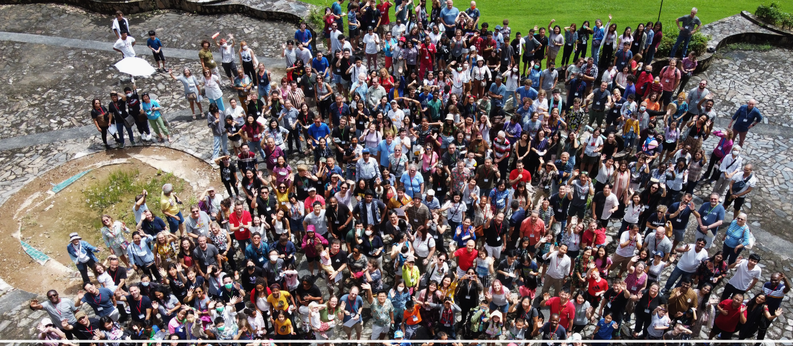
Church Family Retreat: Group Photo