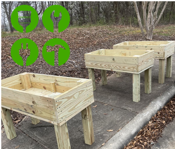
Planter Boxes built for Residents at Cambridge House