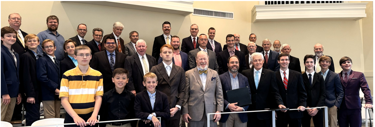
Reformation Men's Choir

Christmas Eve Candlelight Service - at 5pm on December 24, featuring the Christ Church Strings.