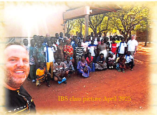
IBS class picture April 2025

suitable for the classroom(s) that it needs. I am so happy to know that a place that has brought us so much joy over the years and has truly been our sanctuary will continue to be that for so many people. A place where they can come and study God's word in a library equipped with French books to help them prepare sermons and Bible studies. A place where they can grow in their faith and knowledge of the Lord. A place for discipleship and training. I pray it will be a refuge from the spiritual battle in this difficult city.