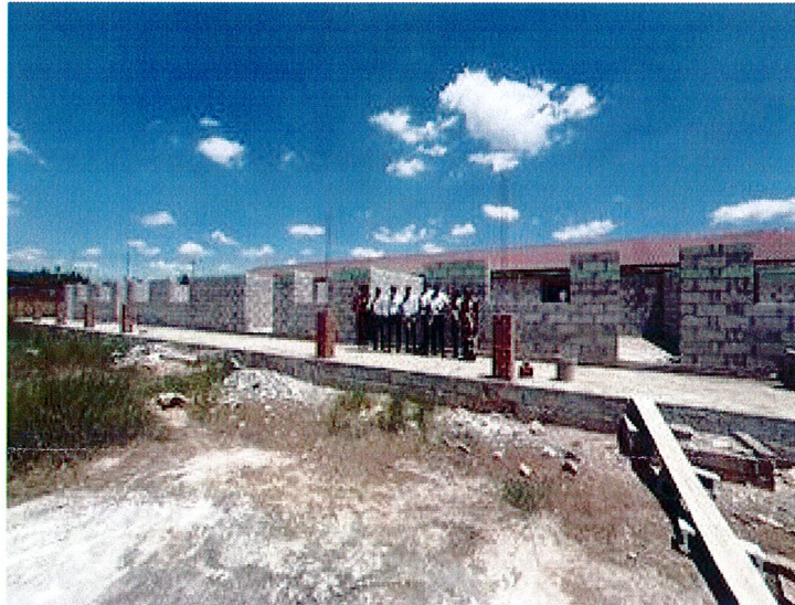
our school building in Kanyama is progressing well