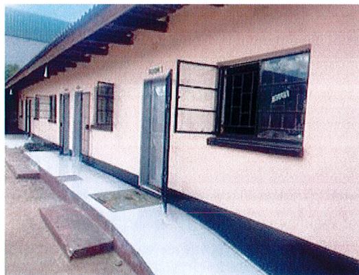
Renovation of the classrooms are going well