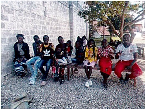
8 deaf got saved during the conference