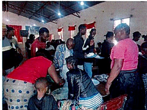
Church working together