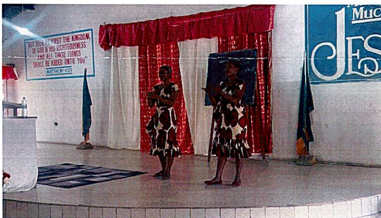
These ladies sing in Sign Language always bless our heart

To Send support to Getaneh's family you can send through Baptist International Outreach, P.O.Box 587, Jefferson City, TN 37760