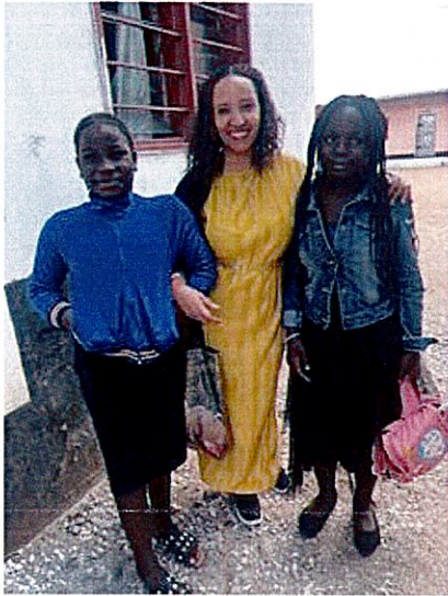
My wife lead 2 children to the Lord