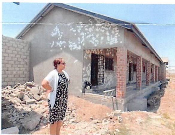
The Deaf School building in Kanyama is progressing well