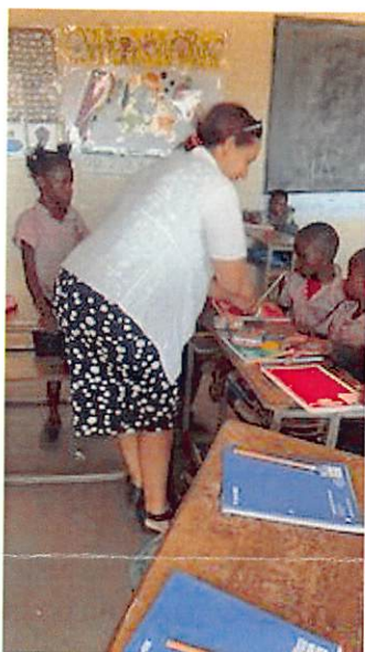
Thank you for the books