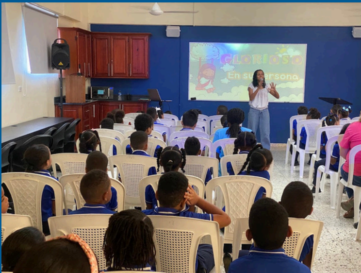
First elementary chapel of the school year.