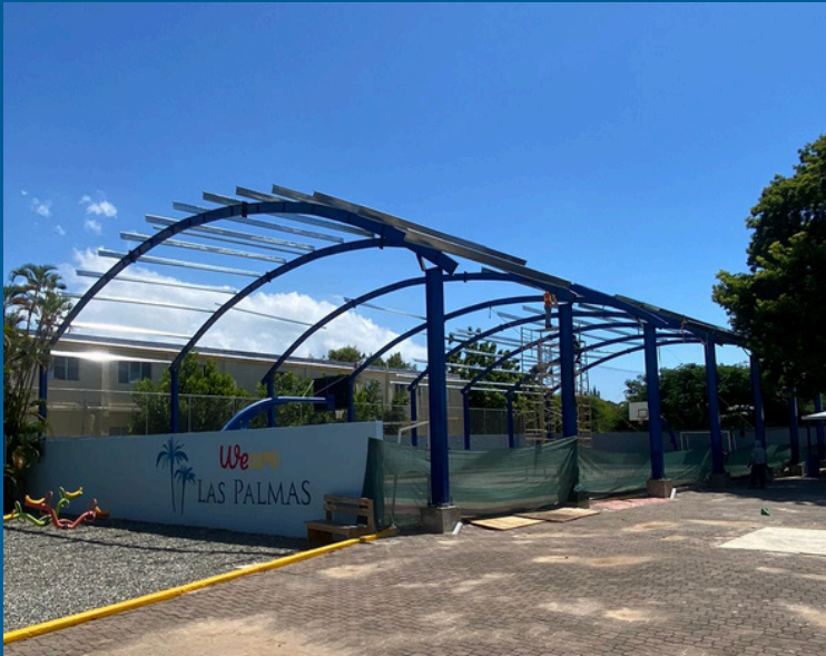
The cover for our court will be completed very soon.

Website: www.dbmi.org/give/ Paypal: j.morla@laspalmas.edu.do