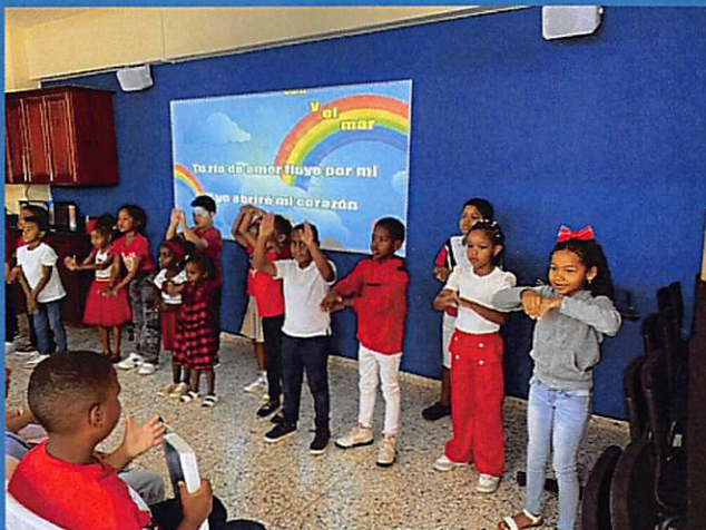
One of the 1st grade groups sang for chapel.