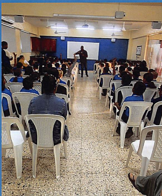
A parent of Las Palmas (and fellow missionary) shared with students during chapel.