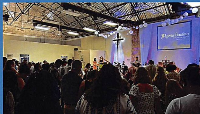
Iglesia Bautista Evangelica de Macoris. God is working. We have a full auditorium every Sunday.