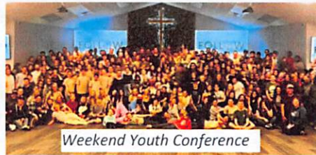
Weekend Youth Conference