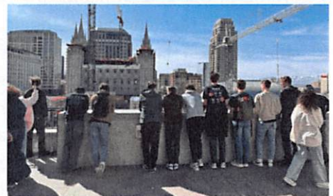
Faith Elevated Team in Salt Lake overlooking the Mormon Temple from the Tabernacle

church plants and helped prepare the way for a future church plant. They also heard testimonies from former Mormons who have come to faith in Christ and had the chance to engage in gospel conversations with several current Mormons and Mormon missionaries. If you or your church are interested in an impactful missions trip to Utah, you can learn more at faithelevatedutah.com .