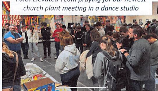
Faith Elevated Team praying for our newest church plant meeting in a dance studio

friends their age in their church. So this time together was a meaningful opportunity to build friendships and experience the joy of being around other kids like them.