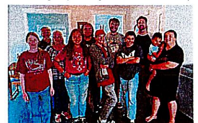
A church group during Faith Elevated camp

Thank you for faithfully standing with us to reach Utah for Christ. The state is only 2% Christian. We are