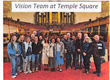
Vision Team at Temple Square

Thank you for your continued support as we labor together for the Kingdom. Utah is estimated at under 2.5% Christian. Lord, help us reach Utah with the gospel!