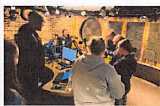
Vision Team at Radio station

Temple Square, meeting local church planters, and learning about ministry challenges in Utah. Pictured in the top right is the team meeting with two Mormon missionaries and on the left a smaller group visiting a local Christian radio station operated by Biblical Ministries Worldwide on the.