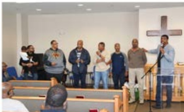
The Men's Ministry Core Team