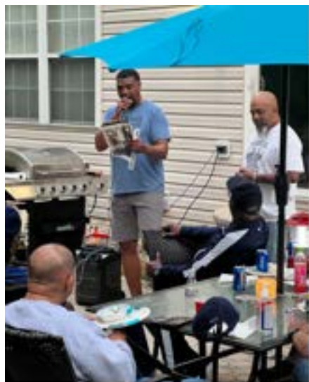
Men's Ministry annual Fish Fry