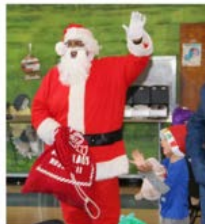
Minister Butler at the women's shelter