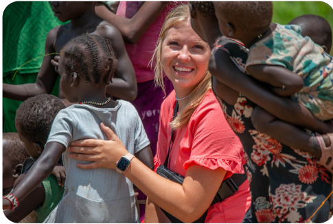
Loving on kids and sharing the love of Christ with them.