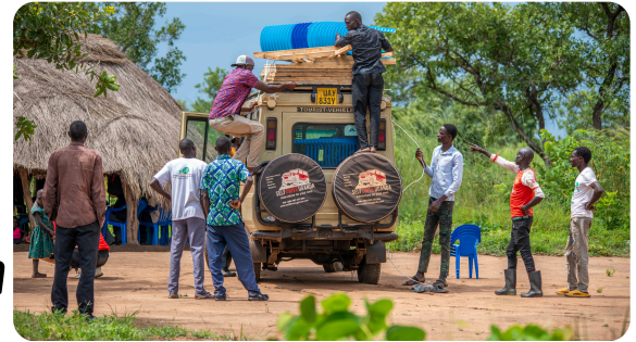
Delivering the equipment to the schools