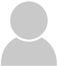
PRAY FOR A Children's Pastor