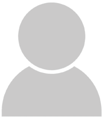
PRAY FOR A Children's Pastor