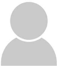
PRAY FOR A Children's Pastor