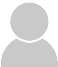
PRAY FOR AN Associate Pastor