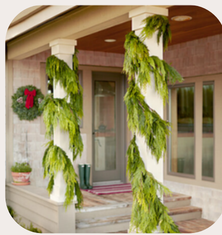
10' Western Cedar Garland $70.00 - DELIVERY

ORDERS ARE DUE BY 11/1 WITH PICKUP IN EARLY DECEMBER / DIRECT DELIVERY ARRIVES DURING THE TWO WEEKS AFTER THANKSGIVING