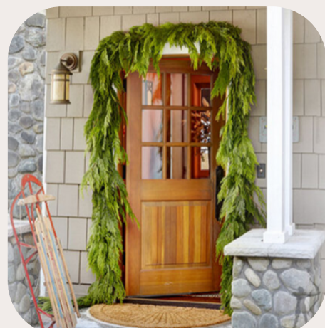
10' Western Cedar Garland $50.00 - PICKUP