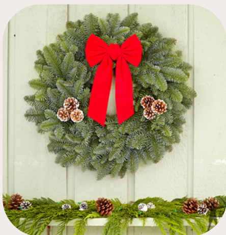
22" Noble Fir Wreath $50.00 - PICKUP

Order online or by phone October 1 - November 1