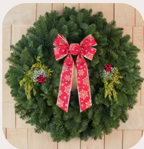
22" Mixed Evergreen Wreath $60.00 - DELIVERY