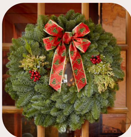
28" Mixed Evergreen Wreath $70.00 - DELIVERY