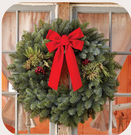
28" Mixed Evergreen Wreath $55.00 - PICKUP