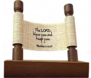
Handmade Miniscrolls Made from papyrus paper

The Pyriam Miniscroll features verses from the Old and New Testaments printed on papyrus paper, wrapped around finely stained wood dowels. A wood base for holding the Miniscroll is included.