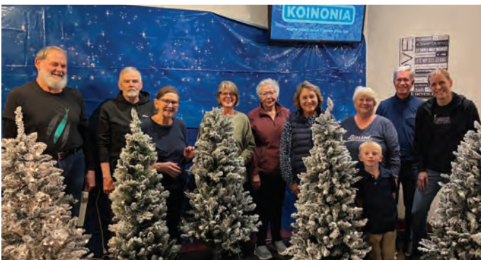
Decorating the Church for Christmas