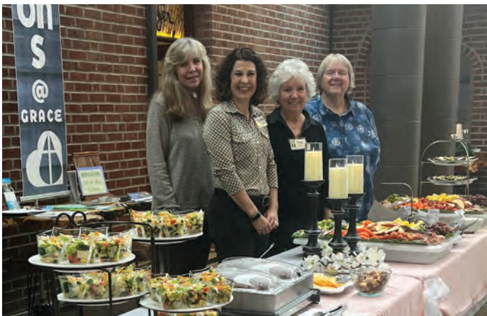
Celebration of Life

Serving as Deacon has given me a front row seat to the quiet, steady faithfulness that holds our church together. It's easy to think of ministry as something that happens only on Sunday mornings, but this year has shown me that some of the most meaningful moments happen in the in between spaces: a phone call to someone who's been on your heart, a doorstep conversation with a member who's been struggling, a prayer shared in a parking lot. These small, everyday interactions have reminded me that God often works through simple presence more than polished words.