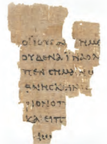
St. John's Papyrus Fragment

Papyrus paper is still 100% handmade in villages along the Nile River. The papyrus reed is cut into thin strips. The strips are soaked and laid out in two layers. After a series of presses, the papyrus paper is complete.