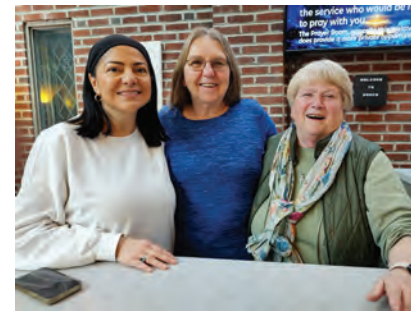
Greeters & Welcome Desk

The Hospitality Team will host a soup dinner for Ash Wednesday on February 18th. Sign-up sheets for volunteer helpers will be at the Welcome Center. There are no baptisms scheduled until Mother's Day. For that day, two have already been scheduled.