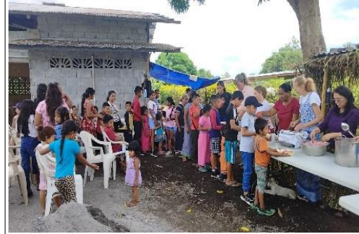
Children's Soup Kitchen

BILL PAY: free option via your online banking. (designated for #858-Azucena Matute)