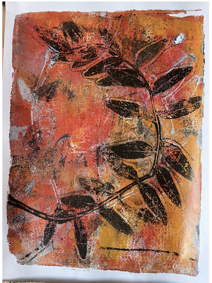
Artist: Sharrata Hunt Acrylic on Paper 8.5x11