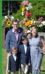
Have Your Picture Taken Easter Sunday in Front of the Cross