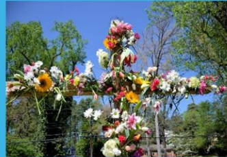
Bring Flowers Easter Morning to put on the Cross