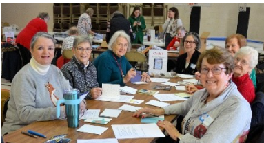
Birthday cards for OGES; Christmas cards for home- bound members

Thank you to all who participated in our Christmas Service Day. We got a lot done for others and enjoyed a musical program from the Anna Julia Cooper School students.