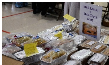
200 mini loaves for the Oak Grove ES staff