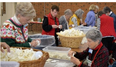
680 candles prepared for Christmas Eve services