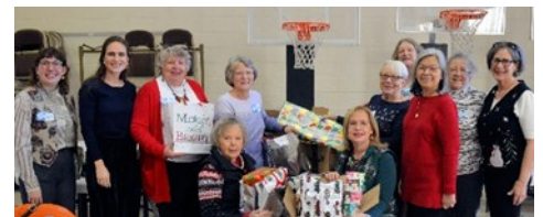
Presents wrapped for Shineforth children