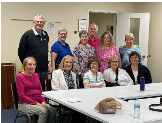
3M Bible Study