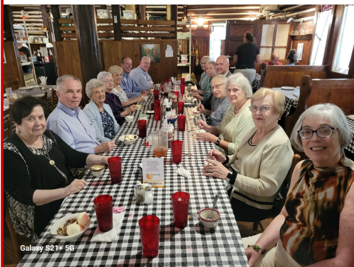
Our Young at Heart enjoyed good fellowship and delicious food on Sunday, September 15 at Tanglewood Ordinary.