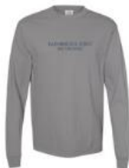
Comfort Colors - Love God, Love Our Neighbor Sh... $25.00 - $29.00