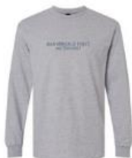
Love God, Love Our Neighbor Shirt - Long Sleeve $20.00 - $24.00