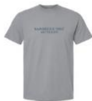
Comfort Colors - Love God Love Our Neighbor $20.00 - $24.00