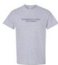
Love God, Love Our Neighbor Shirt - Short Sleeve $15.00 - $21.00