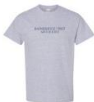
Youth Sizes - Love God, Love Our Neighbor Shirt... $15.00