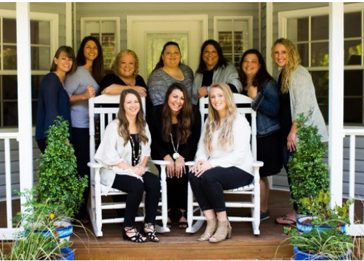
Pregnancy Solutions Center