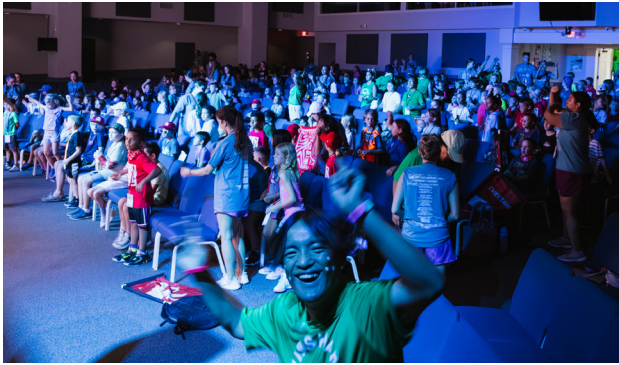
Winshape Camps Each July