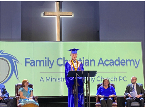
Family Christian Academy