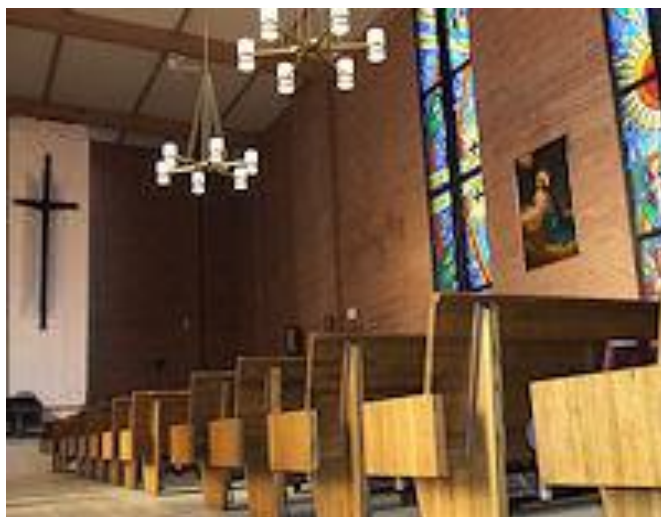
Inside our Sanctuary.