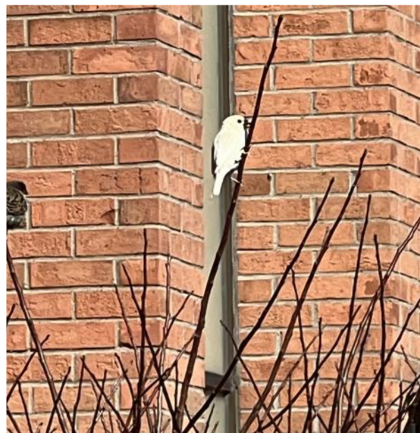
New courtyard resident this spring!