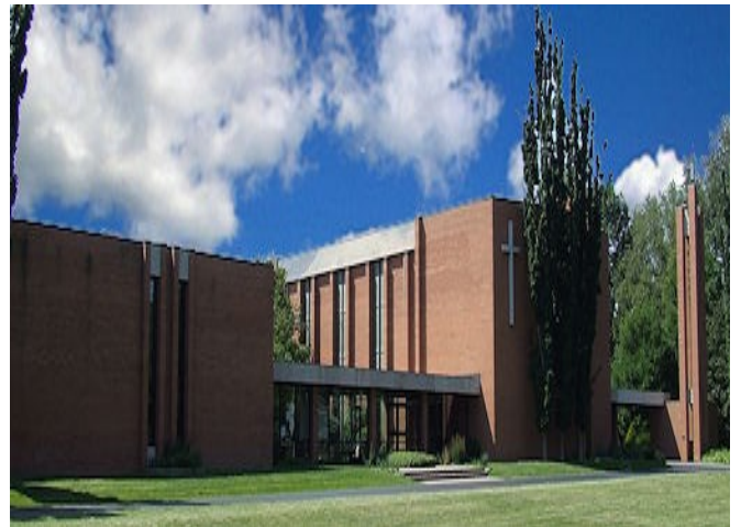
St. John's in the summer sun