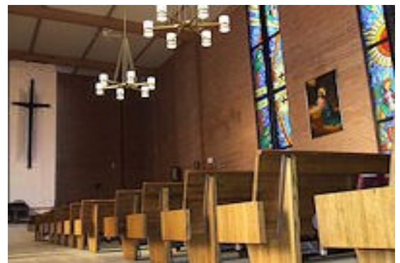
Inside our Sanctuary.

Monday – Wednesday 8:30am– 2:00pm Closed for lunch from 12-1pm Thursdays– 8:30am– noon