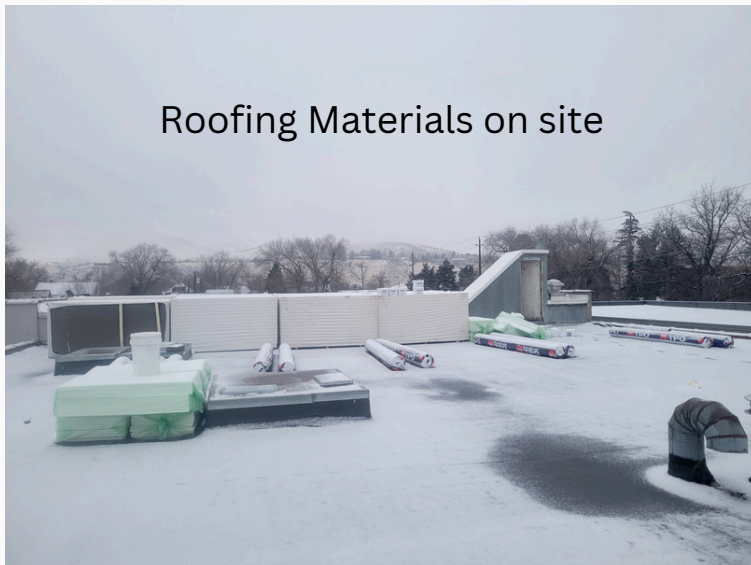
Roofing Materials on site

THANK YOU again for a great end to a great year! Looking forward to another amazing year in 2025.