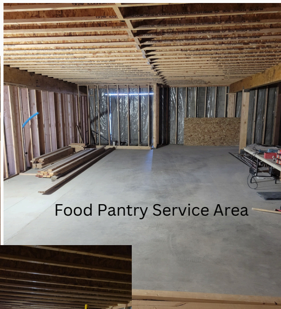
Food Pantry Service Area