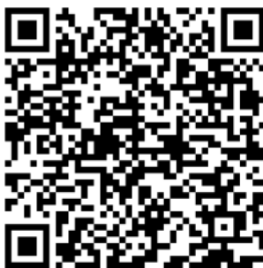
Junior and Senior Youth