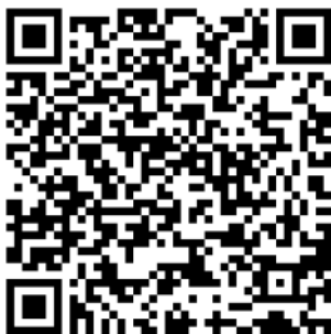
Children and Families