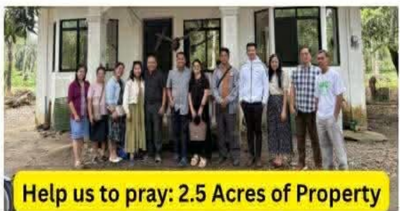
Help us to pray: 2.5 Acres of Property