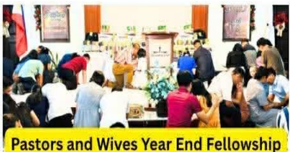
Pastors and Wives Year End Fellowship