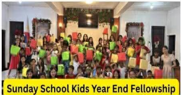
Sunday School Kids Year End Fellowship