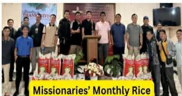
Missionaries' Monthly Rice