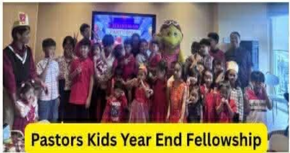
Pastors Kids Year End Fellowship