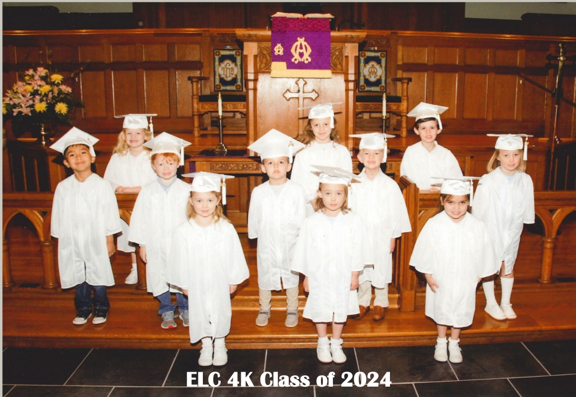
ELC 4K Class of 2024