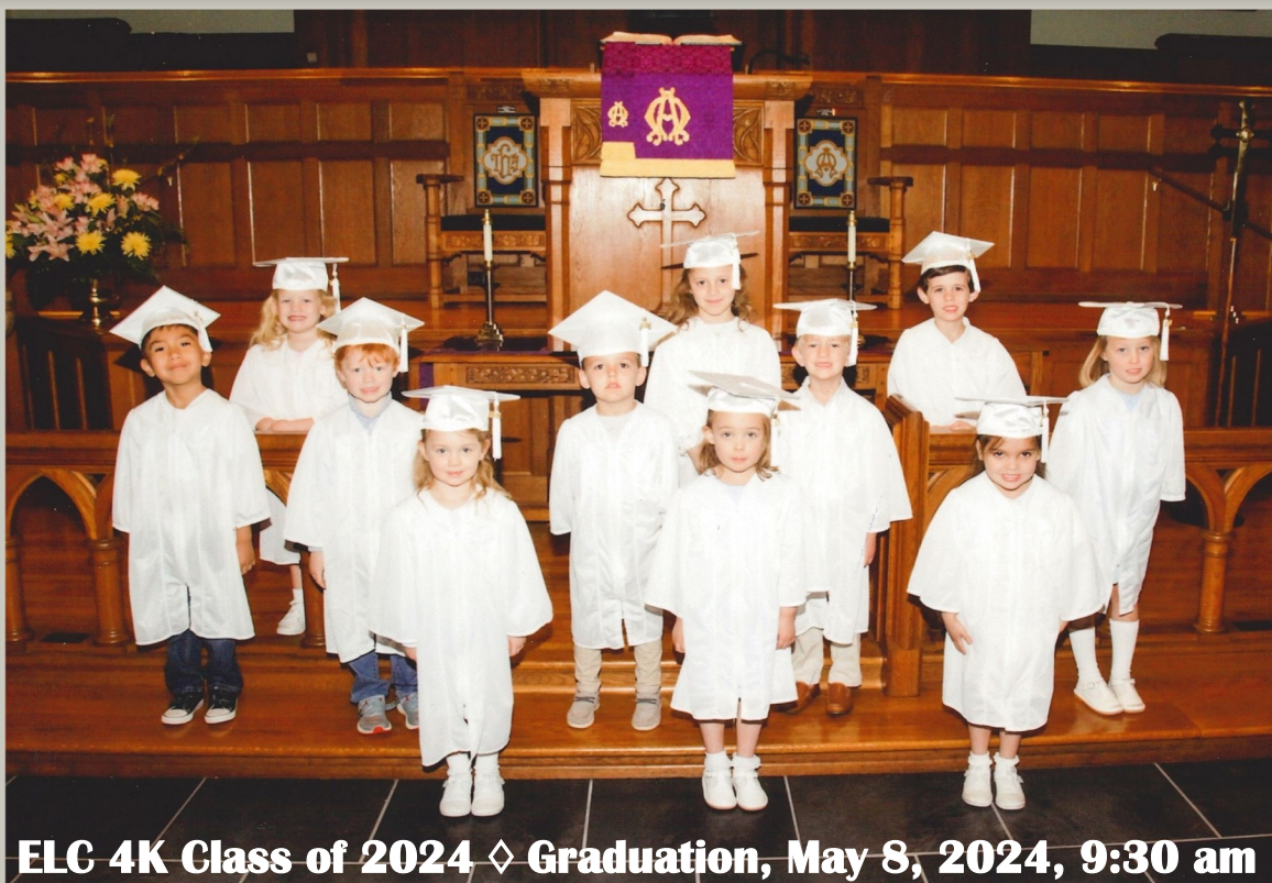
ELC 4K Class of 2024 ♦ Graduation, May 8, 2024, 9:30 am

With your donation of $20 or more, a rose is placed on the altar on Mother's Day, in honor or in memory of your loved one. All donations provide direct support for ELC families whose children would not otherwise be able to afford the program.