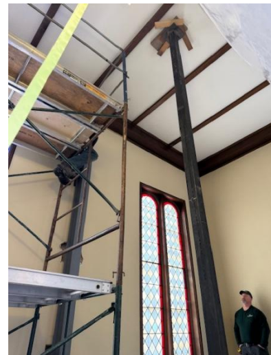
A temporary support