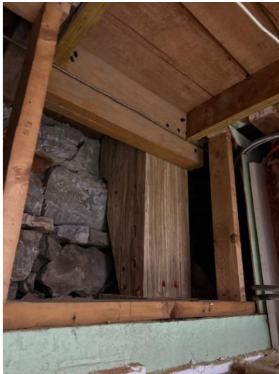
Behind wall in the basement - streetside